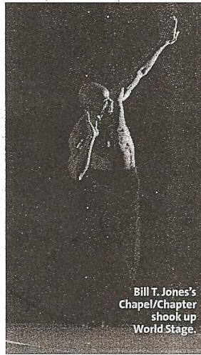
Bill T. Jones's Chapel/Chapter shook up World Stage.